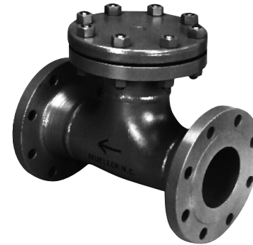
Models 41T, 42T, 44T, 46T